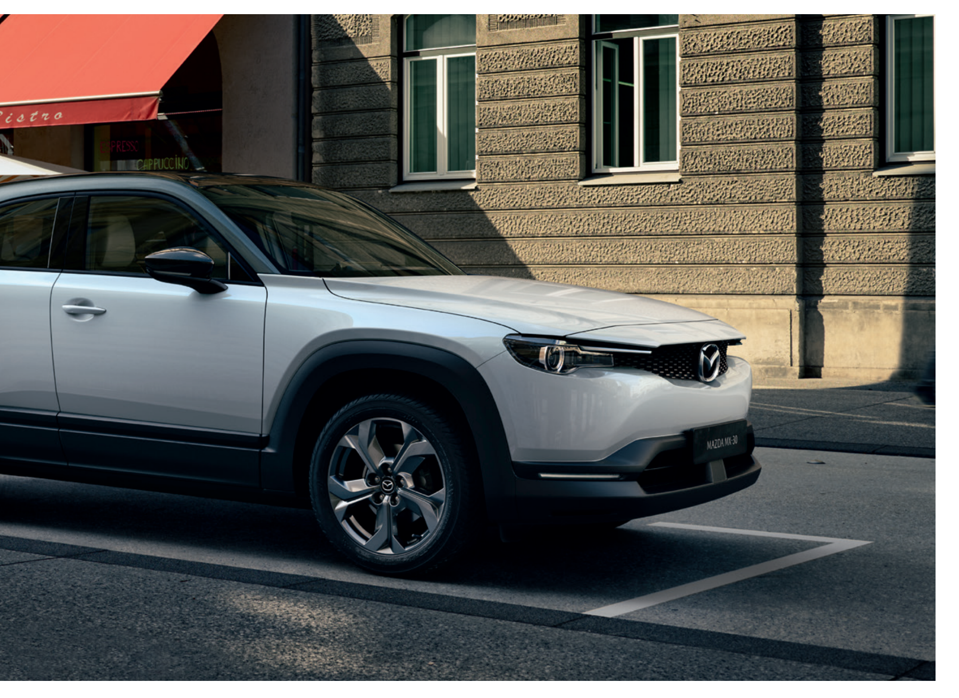
This image is showing the All-New Mazda MX-30 in Ceramic Metallic