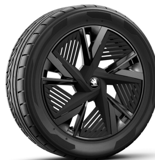
20" 'Draconis' alloy wheels (Code 55K)