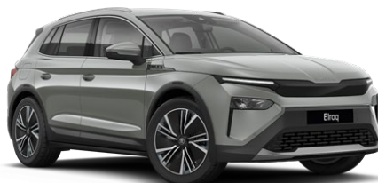
Steel Grey (M3M3 – Solid)