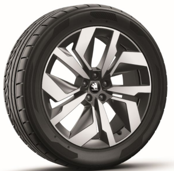
20" 'Vega' alloy wheels (Code CB2/65Q)