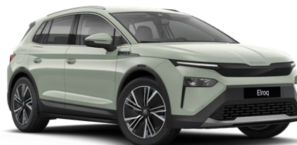
Timiano Green (0B0B – Solid)