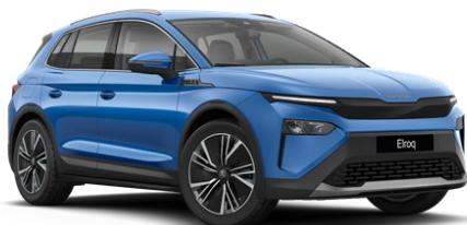
Energy Blue (K4K4 – Solid)