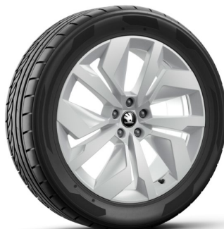
20" 'Vega' alloy wheels (Code PJD/PJE)