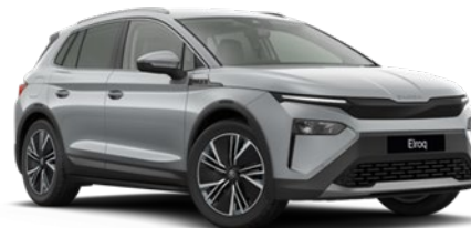
Smokey Diamond Silver (B3B3– Metallic)