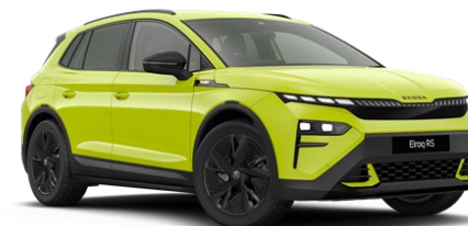
Mamba Green (1313 – Solid)