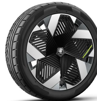
21" 'Vision' alloy wheels (Code PJQ)