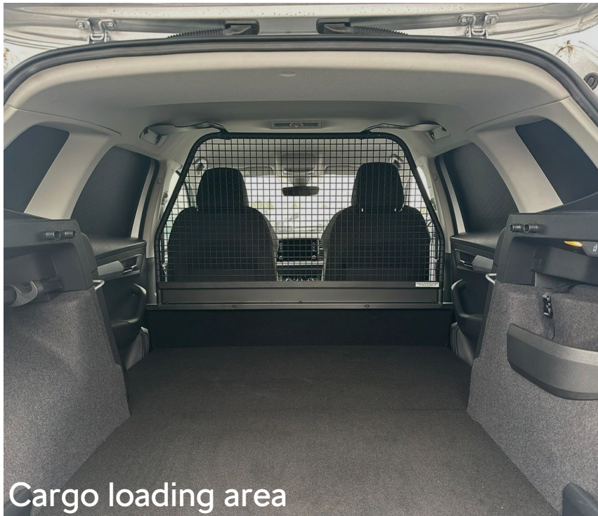
Cargo loading area