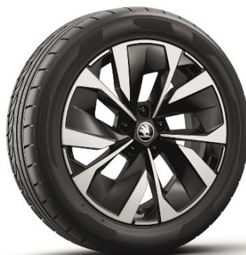
18" Miran Black aero alloy (Code C21)