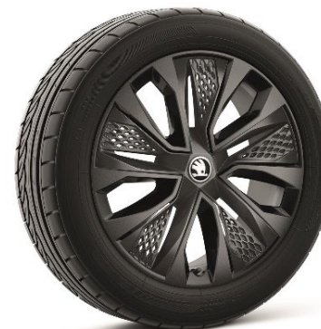
18" Procyon Black incl. black aero inserts (Code C31)