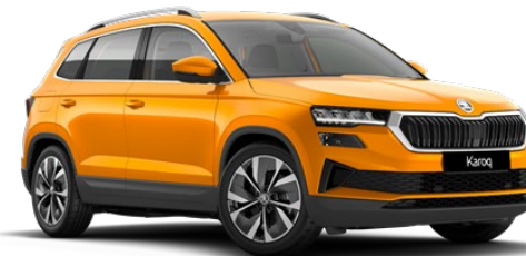
Phoenix Orange (2X2X – Exclusive)