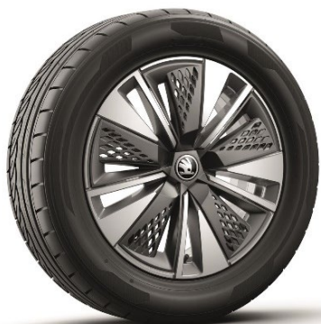
17" Scutus Silver incl. black matt aero inserts (Code U47)