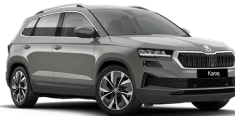
Steel Grey (M3M3 – Solid)