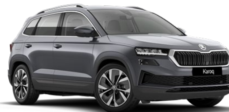
Graphite Grey (5X5X – Metallic)