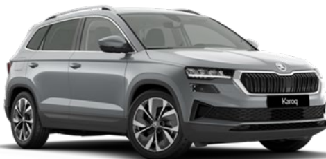
Smokey Diamond Silver (B3B3 – Metallic)