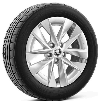
17" Rotare alloy wheels (Code C6U)