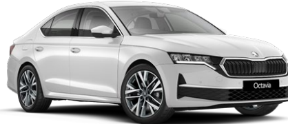
Moon White (2Y2Y – Metallic)