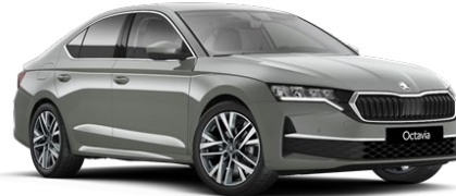
Steel Grey (M3M3 – Solid)