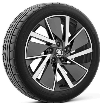
18" Vega aero alloy wheels (Code C8N)