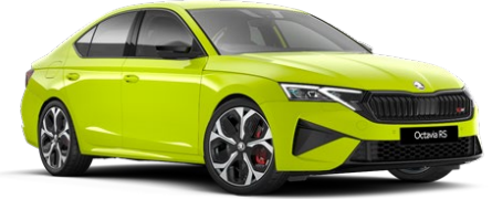
Mamba Green (9P9P – Solid)