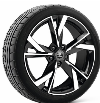
19" Draconis alloy wheels (Code PJN)