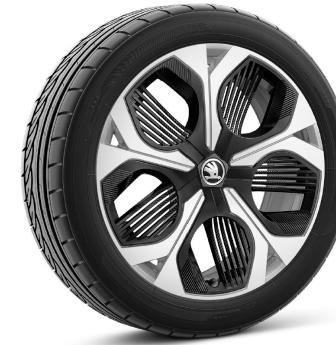
19" Elias silver alloy wheels (Code PJK)