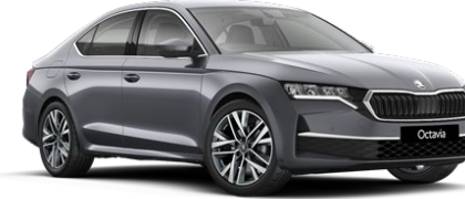
Graphite Grey (5X5X – Metallic)