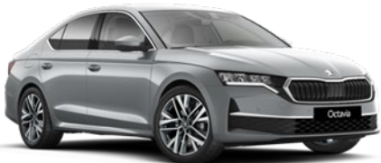
Smokey Diamond Silver (B3B3 – Metallic)