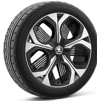
19" Elias anthracite alloy wheels (Code 60L)