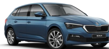
Titan Blue (9F9F – Metallic)