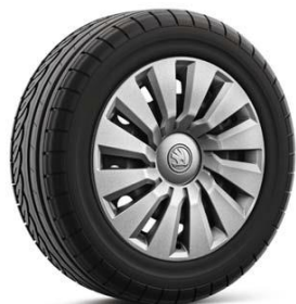
16" 'Tecton' steel wheels (Code C5N)