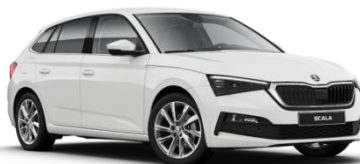
Candy White (9P9P – Solid)