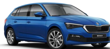
Race Blue (8X8X – Metallic)