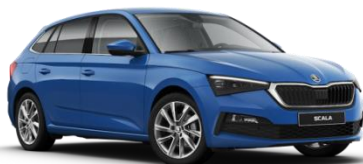
Energy Blue (K4K4 – Solid)