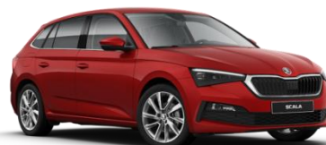
Velvet Red (K1K1 – Exclusive)