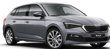
Graphite Grey (5X5X – Metallic)