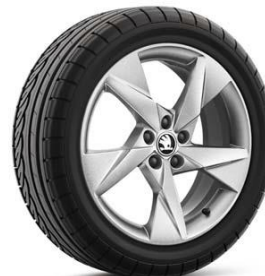
17" 'Volans' alloy wheels (Code P14)