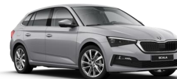
Brilliant Silver (8E8E – Metallic)