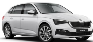
Moon White (2Y2Y – Metallic)