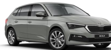
Steel Grey (M3M3 – Solid)