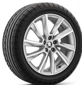
17" 'Stratos' alloy wheels (Code 45H)