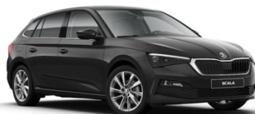
Black Magic (1Z1Z – Metallic)